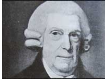
1. Sir Thomas Warner

Dartmouth was in the Rose on his way back to England from Guyana. He took possession of Anguilla " by turf and twig " in the name of King James I. He sailed through the cays on the north side of Anguilla. " There ", he writes, 2 " I think never Englishman sailed before us. " However, he did not stay on the island.