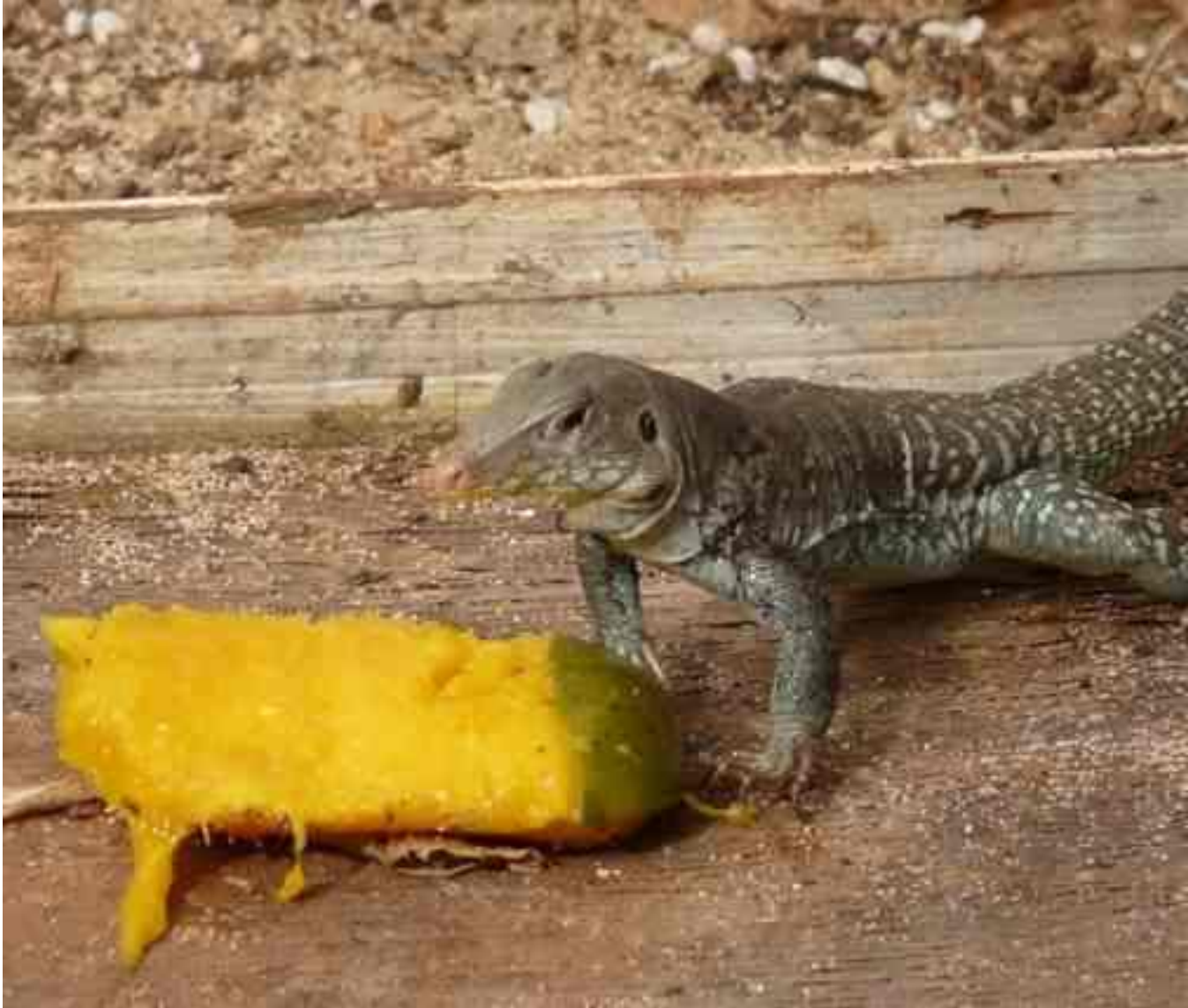
7. The common ground lizard

The word 'Anguilla' is the Latin for eel. The scientific name for the common eel is 'Anguilla anguilla'. An eel may be described as a form of sea snake. Bolstering this theory that the island is named for its snakes is the suggestion that the early English had, as an alternative