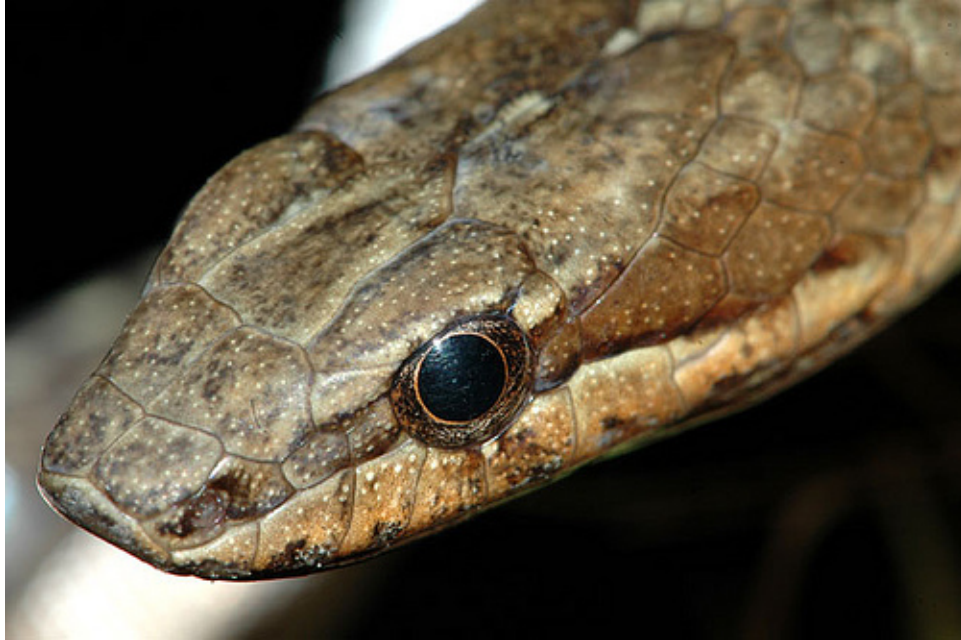
6. The harmless Anguilla racer snake

Scorpions, centipedes, and other insects such as mosquitoes and sand flies, could also have accounted for the words 'noxious animals', but their stings are not fatal. The name Merrywing Pond at Cove Bay memorialises the seventeenth century name of the mosquitoes and sand flies that still infest the island during and after periods of rain.