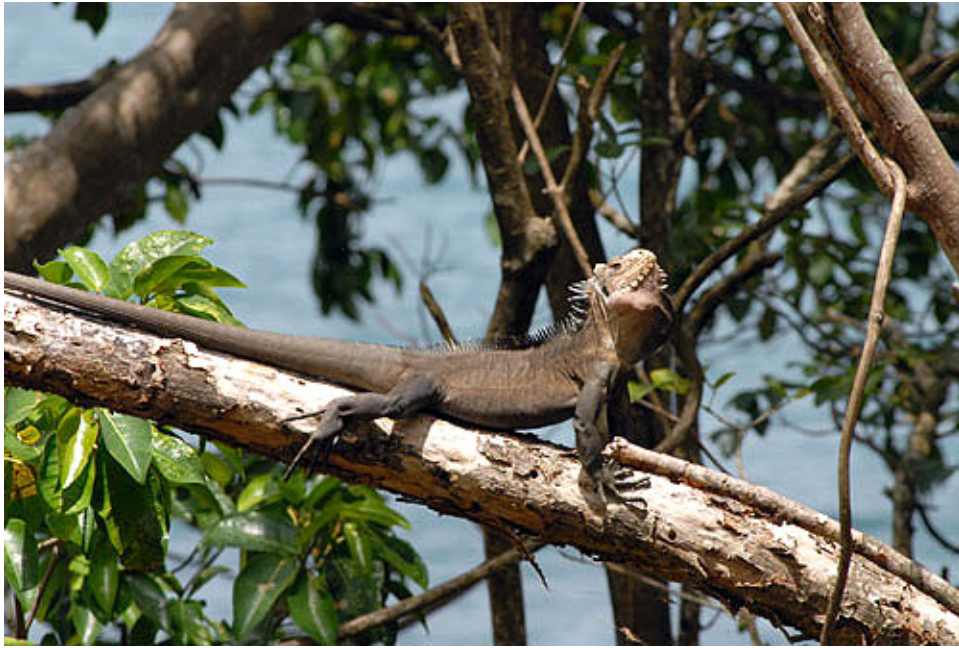
5. Iguana delicatissima

Anguilla, were mistakenly called alligators (see illus 4 and 5).