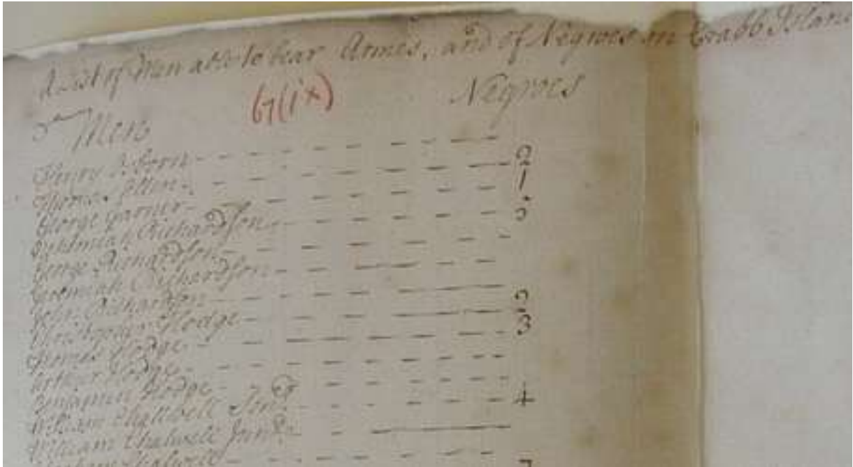
4. An extract from the Crab Island census of 1718. CO.152/12/2.

in Anguilla until they were sure that it was safe to join the men. Their hope was to make Crab an Anguillian dependency. Several wives and children, as we shall see, later joined the men on Crab Island before the settlement was finally destroyed.