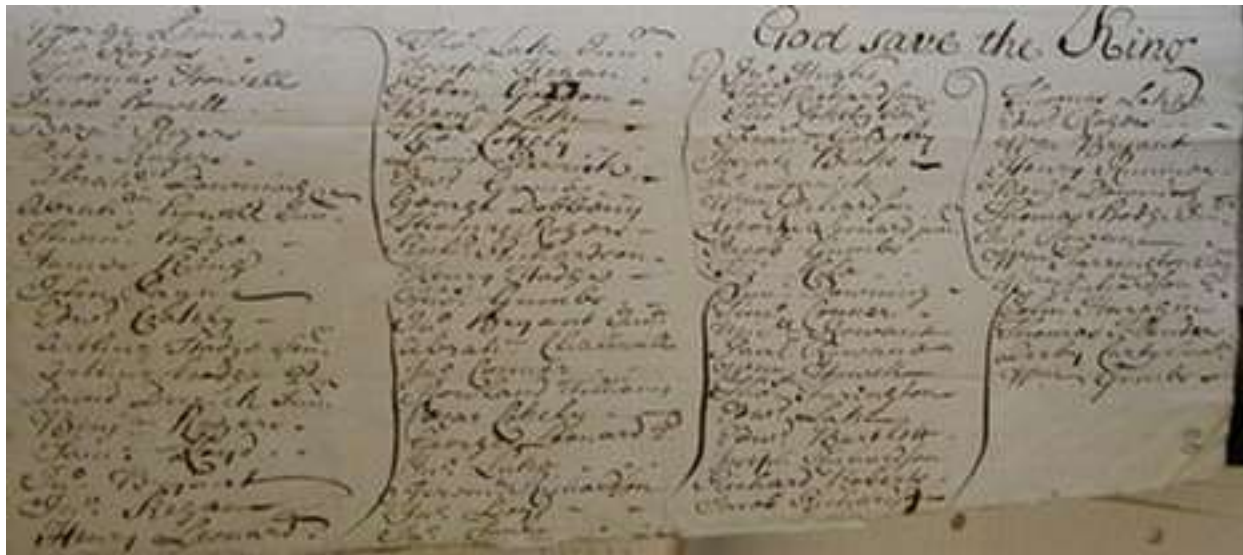
5. The signatories to the 1727 proclamation: CO.152/16.

Crab, we turn to the Proclamation of 1727 to glean what little information we can from it. 17 The signatures interest us (see illus 5).