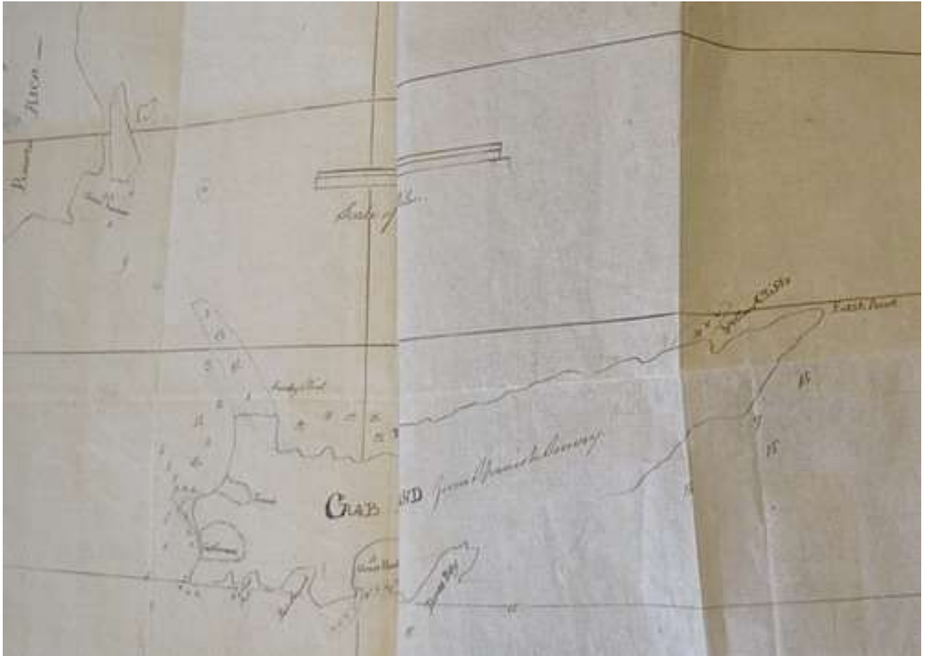
6. Crab Island in 1818.