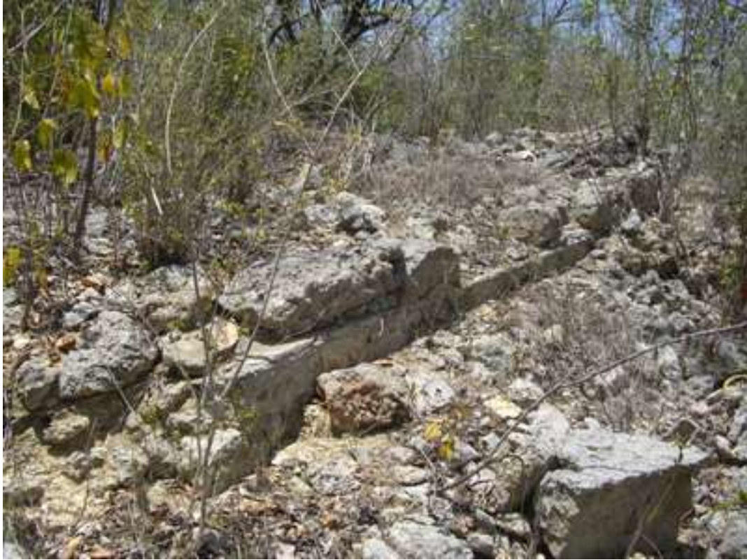
6. The overgrown, derelict animal round at Benzies sugar works (by the author).

Commerce and society among the planters and merchants reached a high point in Anguilla in the last few decades before the rebellion in the northern colonies of America brought ruin to many of them. The resulting British blockade of trade between the Leeward Islanders and the rebelling colonists ended a lucrative market for Anguillian traders and smugglers. Lawsuits recorded in the Anguilla Archives after 1776 were no longer brought for tens of pounds sterling but for smaller amounts of mere shillings and pence. The second Anguillian war of 1796 when the invading French burned The Valley