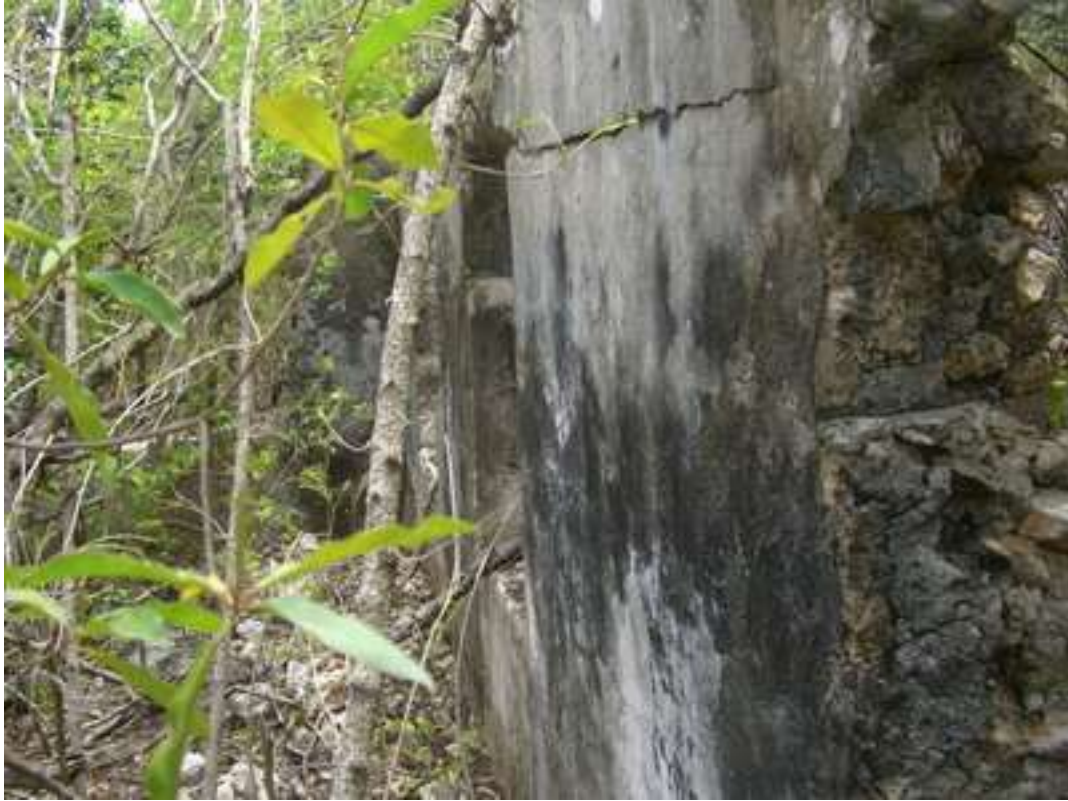
5. The ruined and overgrown, plastered inside wall of the curing house at Benzies.

There is no information, however, on who the leaders of the Anguillian slave rebellion were, or on the outcome of the plan. There was also a big slave uprising in Antigua that year, which was savagely suppressed. Mutilation and maiming, if not death, would be the fate of any Anguillian black person discovered planning to join the rebellion in St Martin.