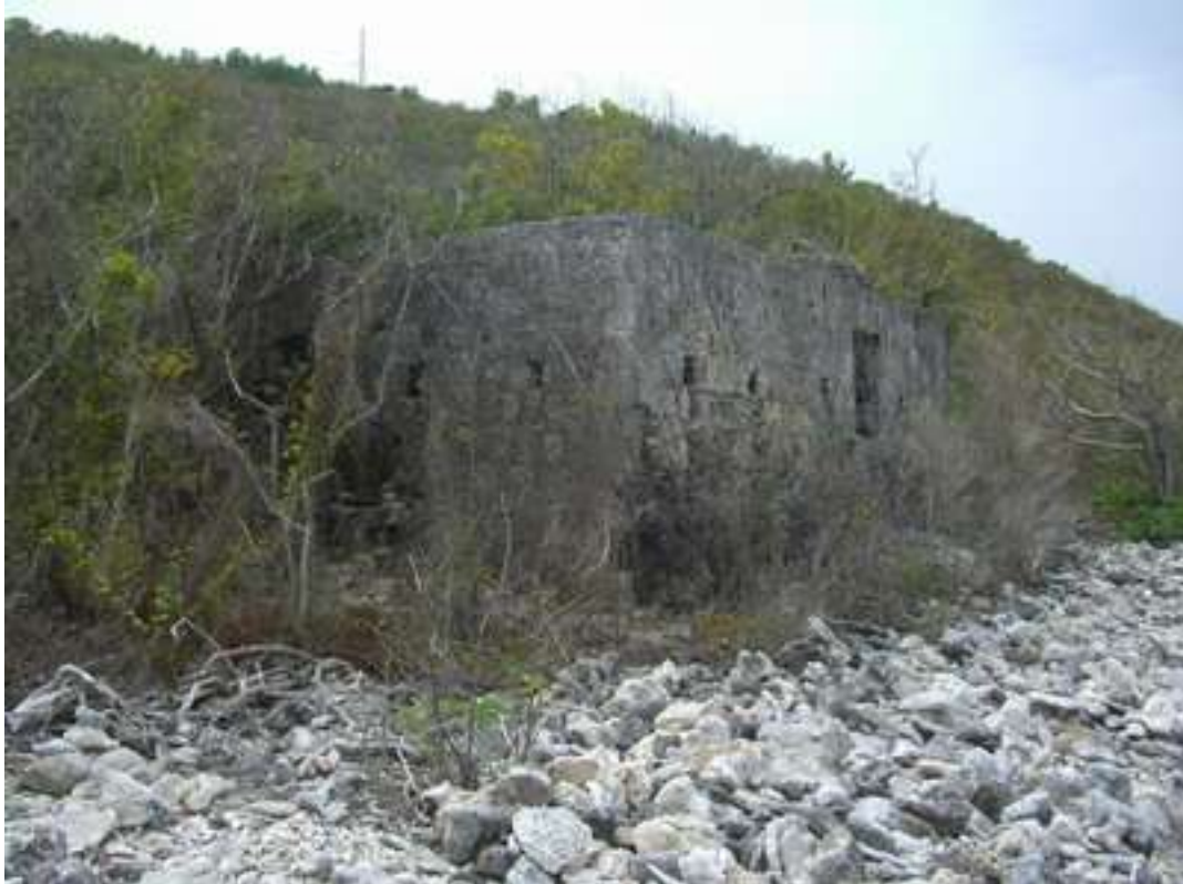
4. The overgrown ruin of the sugar boiling house at Benzies (by the author).

They are very small in comparison to the ruins of the other sugar islands. They were not in use for any long period of time. We do not know if this small, abandoned factory ever made any sugar. We do not know who owned it. 'Benzies' is more accurately the name of a nearby bay, used for swimming years ago by the residents of North Hill.